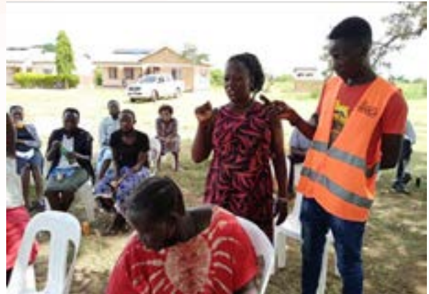
Community Dialogues in Nakapiripiriti and Napaak

The leaders follow up meetings and community dialogues were facilitated by four (4) AMICAALL staff teams, assisted by the urban authority and district local coordinators, the community development officers, the Mayors, health teams majorly health educators and health inspectors among others. Each district was given an opportunity to select a media house to host a radio talk show, do the recording at the community dialogue, edit and produce use the material in different media.