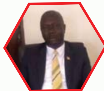
HW Wilson Sanya Koboko Municipal Council Mayor