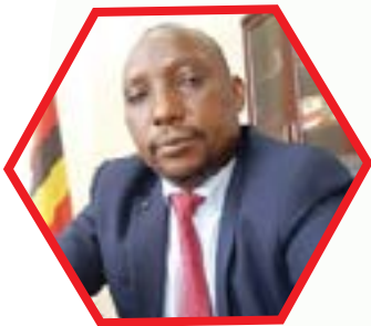
HW Sentaro Byamugisha Kabale Municipal Council Mayor Member