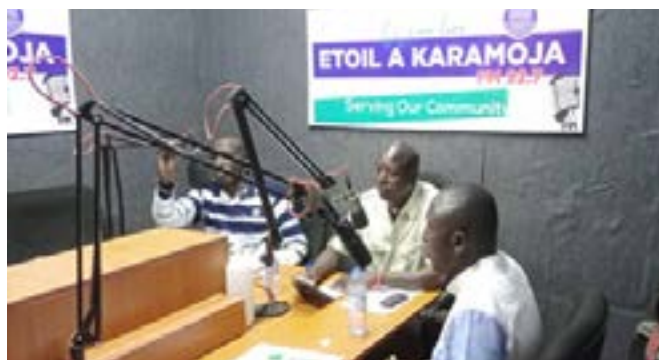
Live Radio talk show on Etoil A Karamoja FM in Kotido Municipality.

Ltd for Kiryandongo, Woebil Communications Ltd for Abim and AKICA 104.7 FM for Napak. On average there were 12 callers per radio talk show, totalling 144 people who called in inquiring on various issues around SRH, HIV and GBV. It is estimated that a total of 10,729,000 million people were reached by these radio stations because the radio coverage includes the districts and urban centres of Omolo, Gulu , Lamwo, Agago, Pader, Kitgum, Apac, Lira, Kwanja, oyam, Kole, Aleptong, Nwoya, Abim, Kotido, Kaabongo, Otukey, Dokolo, Amulata, Amuria, Kaberamaido, , Katakwi, , Soroti, Serere, Bundibugyo and Eastern congo, Yumbe, Arua, Adjuman , Maracha, Koboko, Moyo, Masindi, Apach, Hoima, Buliisa, Napak, Karenga, Moroto, Pader, Karenga, Amudat, , Nakapiripiriti Amudat, Jinja, Mbale, Nakaseke, Nakasongola , Kayunga and Buyende.