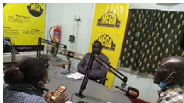
Radio talk show at Mega FM, Gulu City