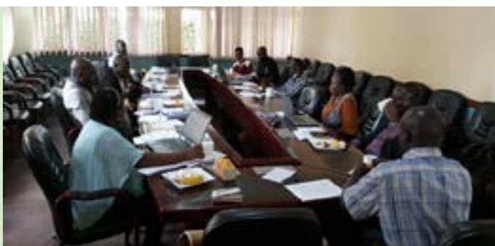
NCD follow up meeting in session in Jinja City with stakeholders

The Stakeholder meeting targeted 32 participants (Females -17, Male-15) who included urban authority leaders, Ministry and Departments and Agencies, members of parliament (NCD forum), development partners, civil Society organizations, private sector, AMICAALL staff and the board.