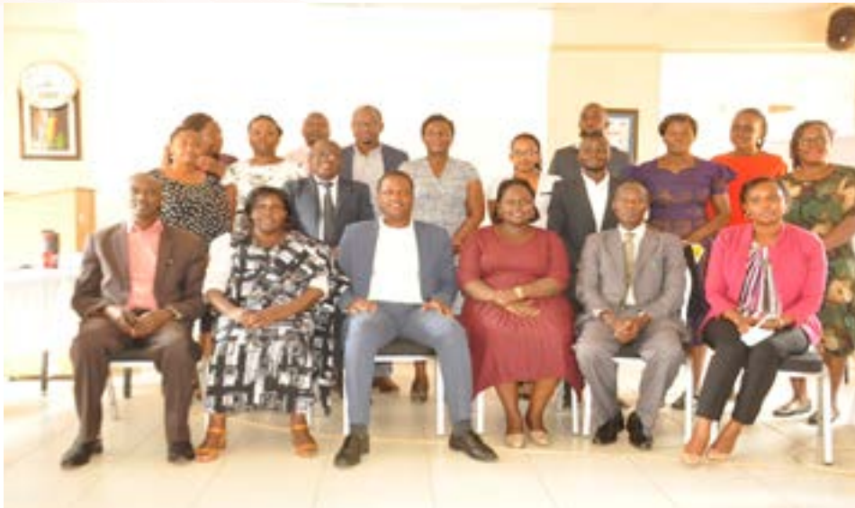
Participants of the National multi stakeholder's feedback meeting on NCDs & Mental Health at Eureka Hotel-Ntinda.

The Multisector Orientation meetings in the 8 cities were attended by 165 participants - 67 females and 99 males. The participants included Town Clerks, Deputy Town clerk, and heads of departments for production, engineering, public health, education, community development and Physical Planning. Others were political leaders who included secretaries for health, mayors, Deputy Mayors, secretary for finance and works and physical planning, RCCs, Youth councilors; representatives from civil society and the private sector.