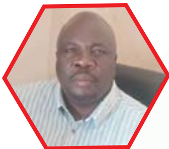
HW Amin Sadiq Busia Municipal Council Mayor