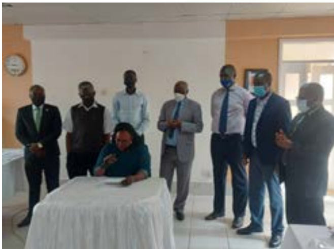
Mayor Masaka City reading a communique on behalf of urban leaders

The multi-stakeholders' meeting laid the ground for the subsequent meetings and actions aimed at strengthening coordination of NCDs and mental health preventive and advocacy activities in cities and other urban authorities.