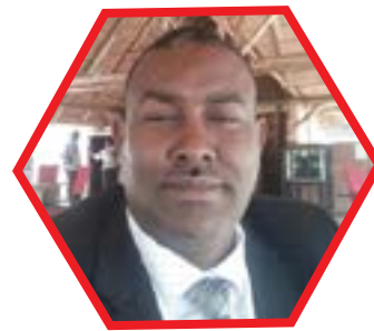
HW Ismail Muhammed Moroto Municipal Council Mayor Karamoja Region Representative