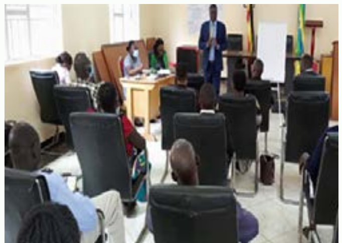
Mayor Gulu City committing on NCDS and Mental Health in Gulu